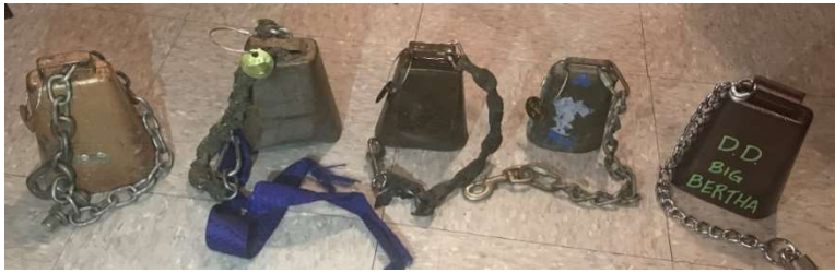
From left to right cowbell 1, 2, 3, 4 and 5