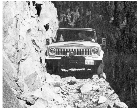
Emi asking "Did we make a wrong turn".