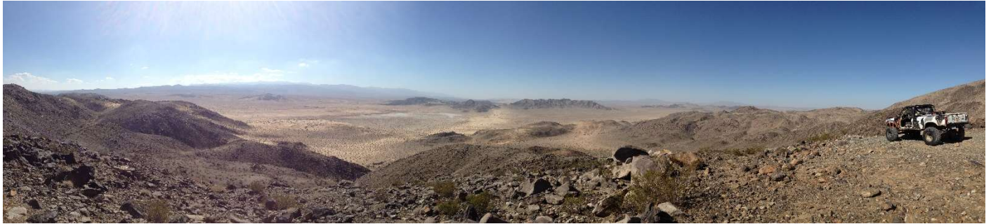
Means Dry Lake after it rained 4 inches in 18 hour period October 2018.